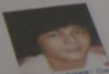
Above Images: Gal