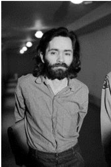
Charles Manson in 1969.