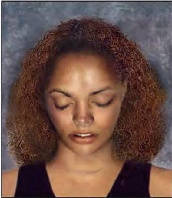
Likeness of victim