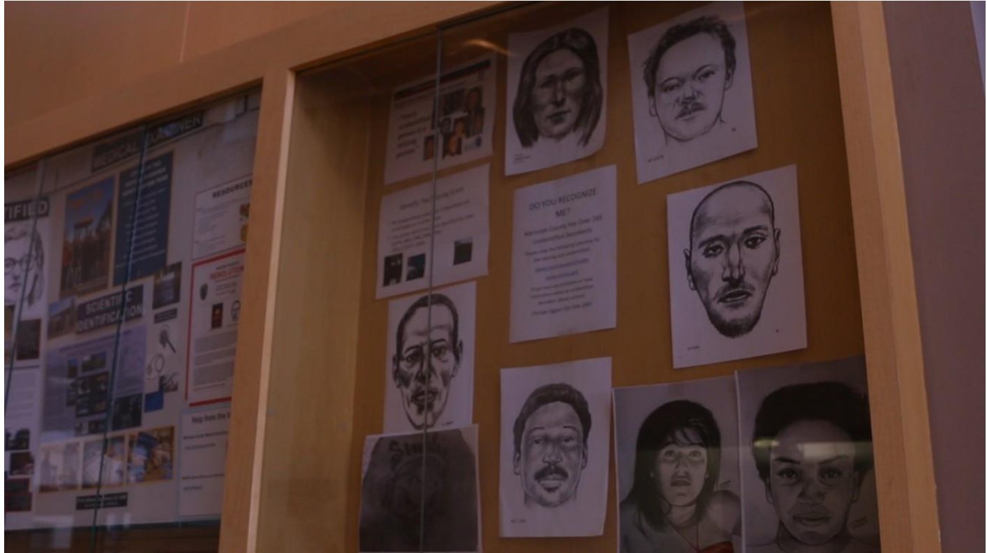
A display case at the Maricopa County Medical Examiner's Office

After 38 years of doggedness and sleuthing, investigators have identified a homeless man murdered in South Phoenix.