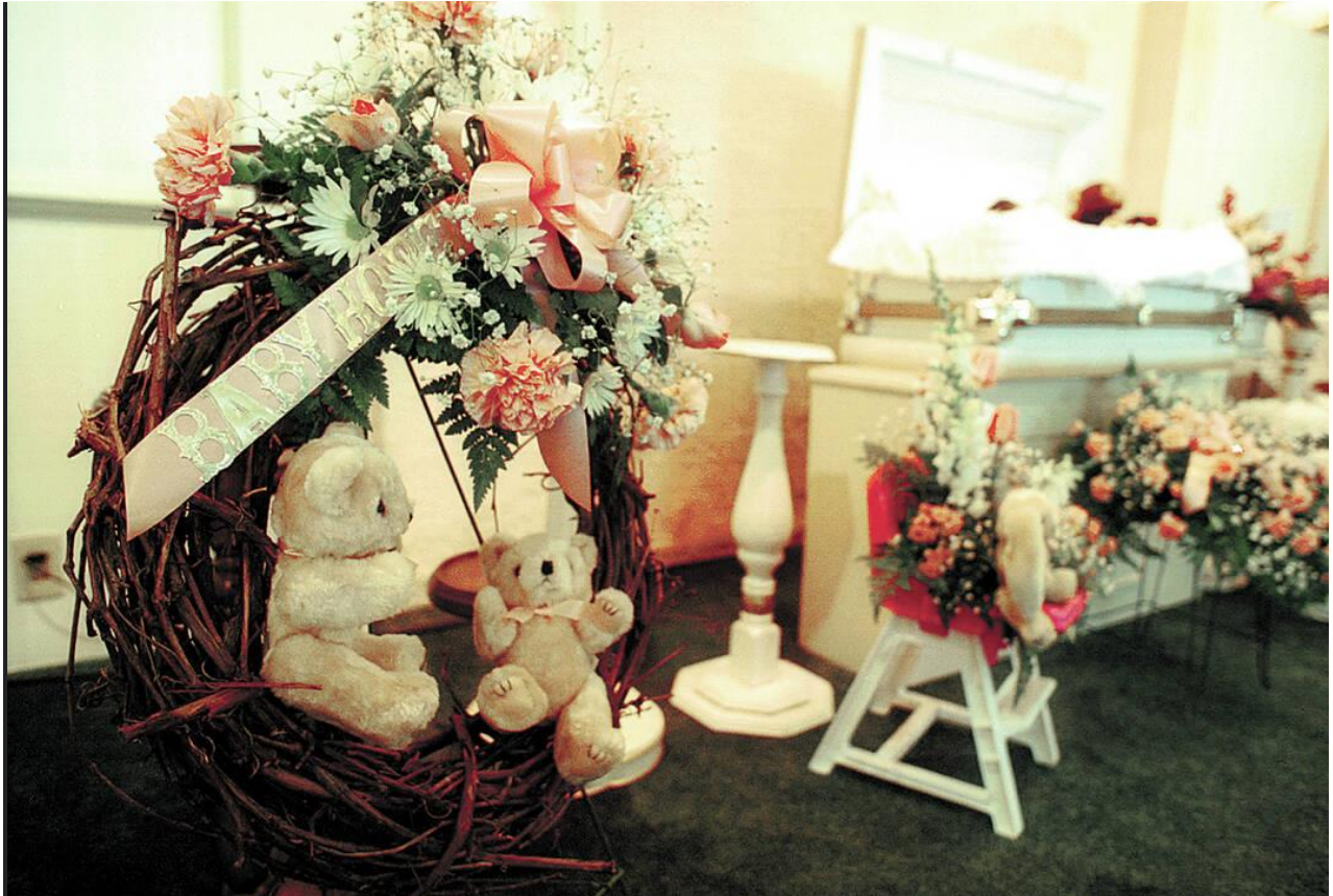
This 1994 photo shows the funeral of Baby Hope, whose burial was funded by donations from the public. Police held a press conference releasing new information on her death on Monday.